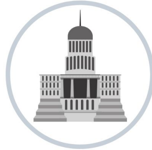
BUSINESS ECONOMICS & PUBLIC POLICY