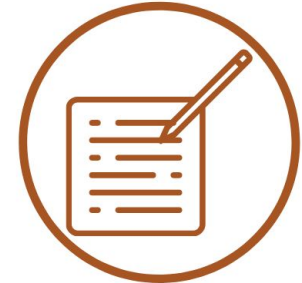
INDIVIDUALIZED FIELD OF STUDY