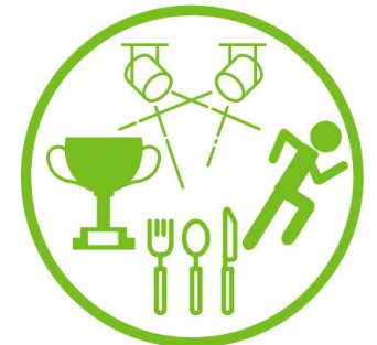
SPORT, EVENT, & HOSPITALITY MANAGEMENT

Only GWSB students may declare these concentrations.