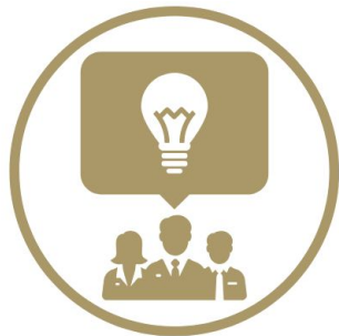
INNOVATION & ENTREPRENEURSHIP